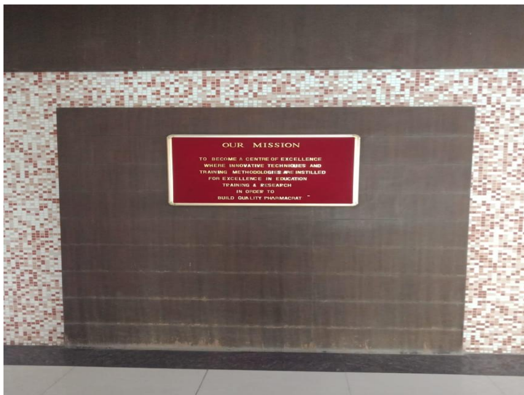
Display of Mission at Entrance of college