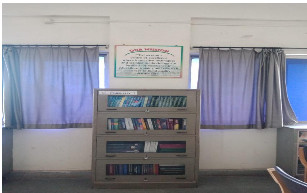
Display of Mission in Library