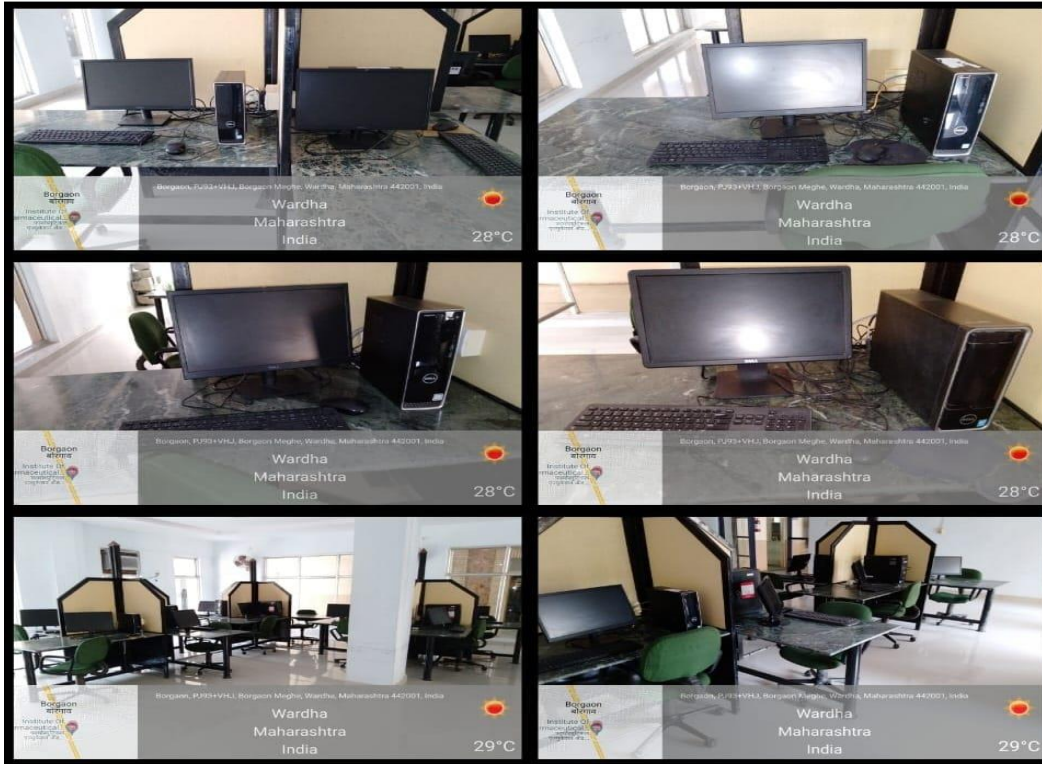
Dell Desktops – 10 pcs