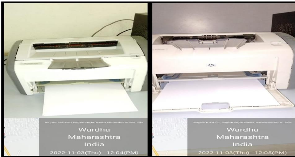
HP Laser Jet 1020 Printers – 2 pcs