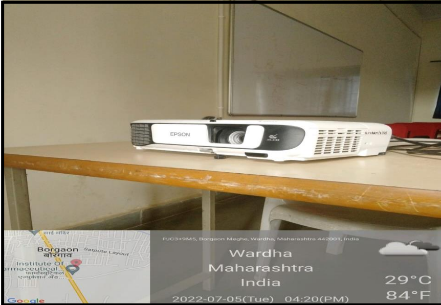
LCD PROJECTOR – EPSON INSTALLED IN ROOM NO. 313