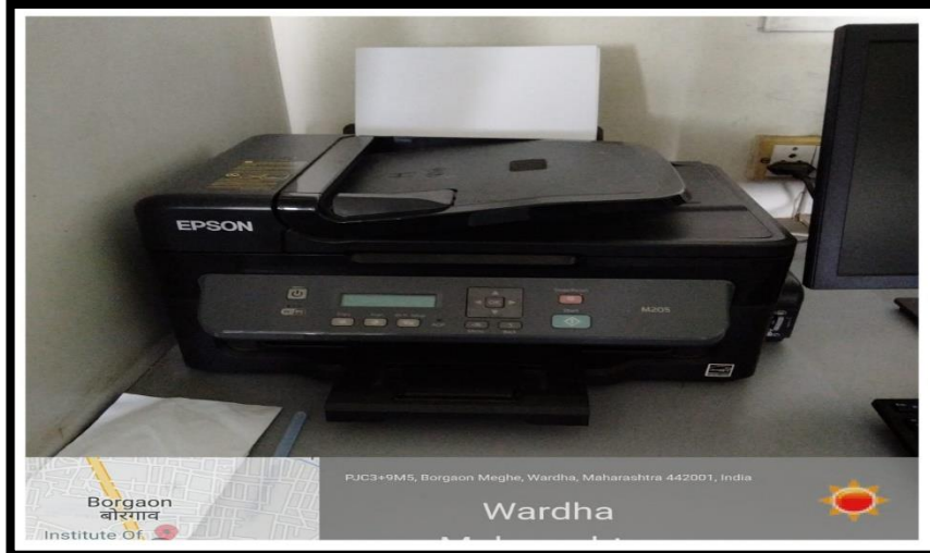
EPSON M205 INKJET TANK PRINTER